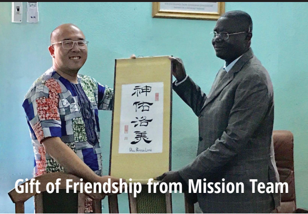
Gift of Friendship from Mission Team