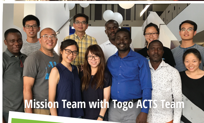
Mission Team with Togo ACTS Team